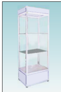
Show Case (Slim) W H D 50cm 200cm 50cm