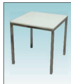
Square Table W H D 70cm 70cm 70cm