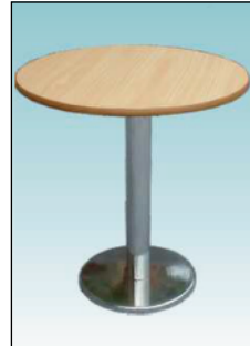
Round Table Dia H 70cm 75cm