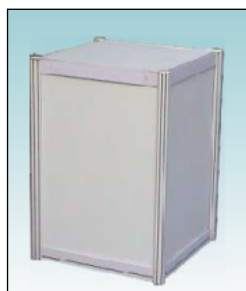
Podium W H D 50cm 70cm 50cm