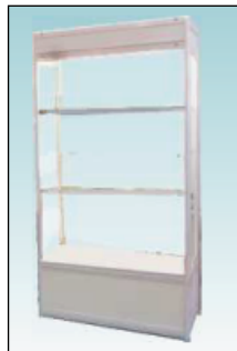
Glass Show Case W H D 100cm 200cm 50cm