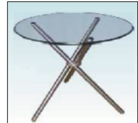
Round Table (Glass top) Dia H 90cm 75cm