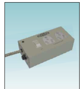
Socket Out Let