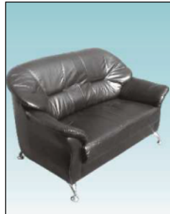
VIP Sofa Double