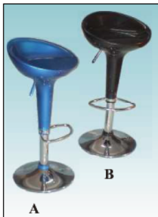
Bar Stool (Adjustable) H - 50cm