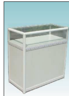
Glass Counter W H D 100cm 100cm 50cm